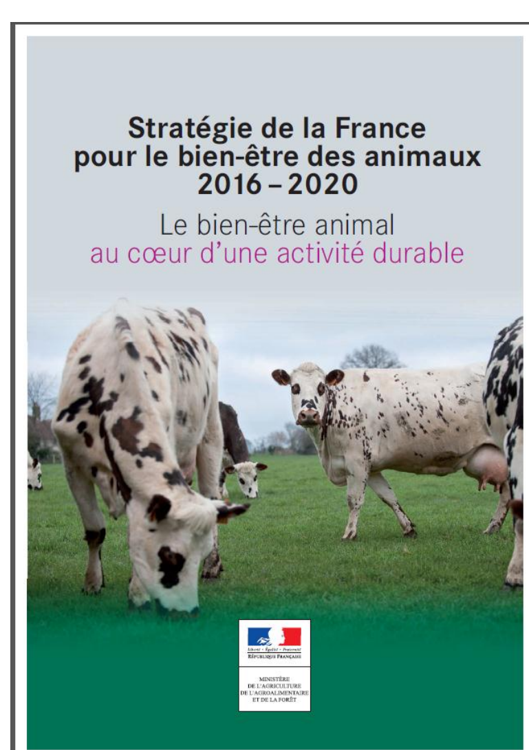
Fig. 1 French Animal Welfare Plan 2016-2020

To review what private labels related to animal welfare already exist in France and to do benchmarking in other countries.